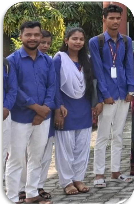
Dress Code for PG students (Assamese Dept.)