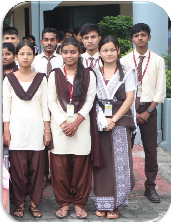
Dress Code for HS & UG students

The college has a dress code for students. It is compulsory.