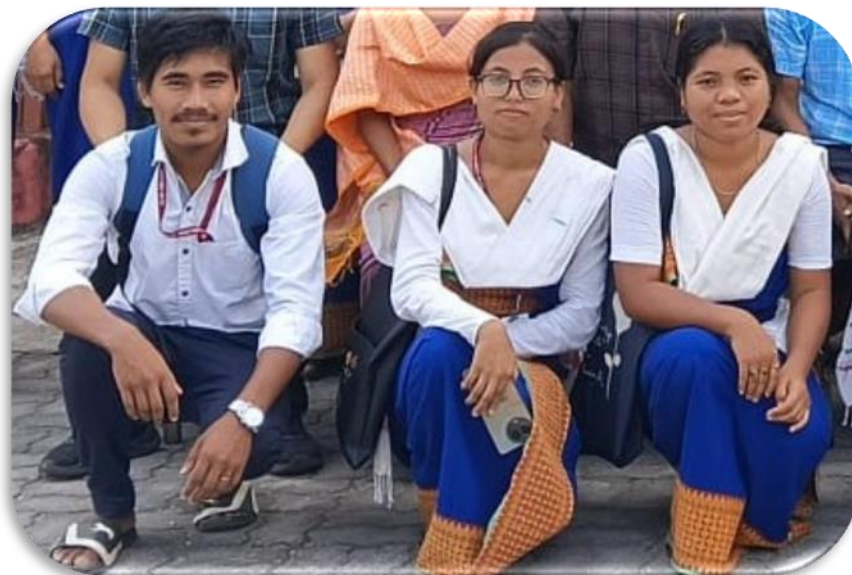
Dress Code for PG students (Bodo Dept.)